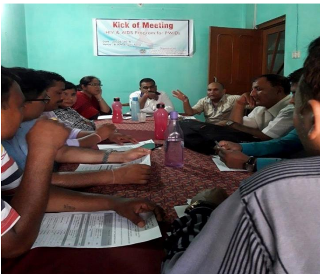
Organizing Kick Off Meeting