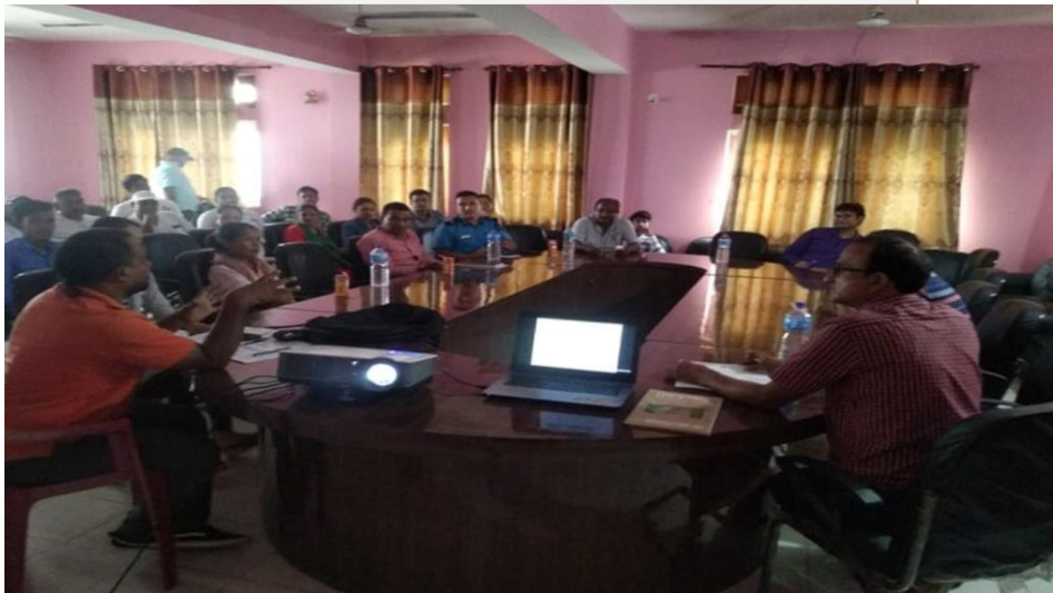
Stakeholder Meeting with Narayani Hospital