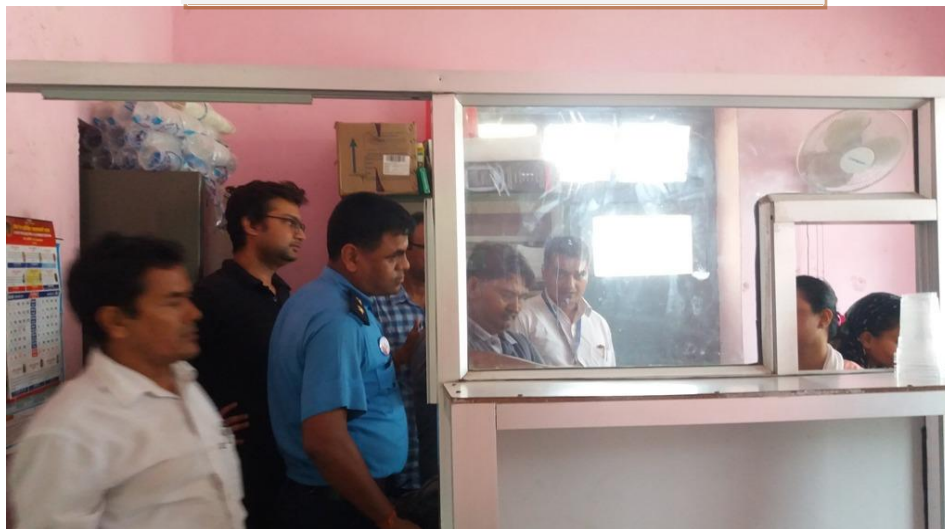
Joint Monitoring Visit of OST