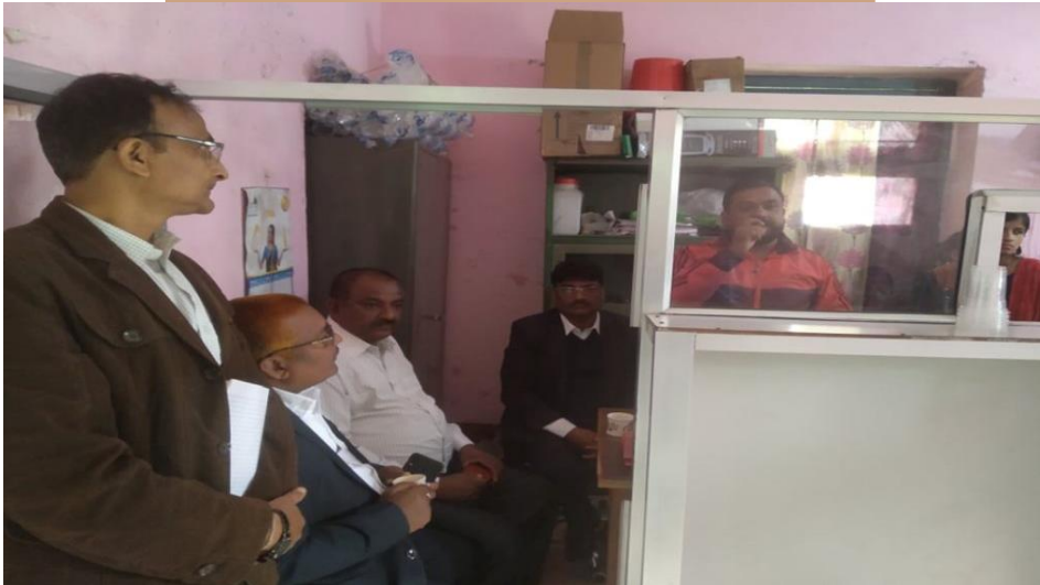
Joint Monitoring Visit of OST