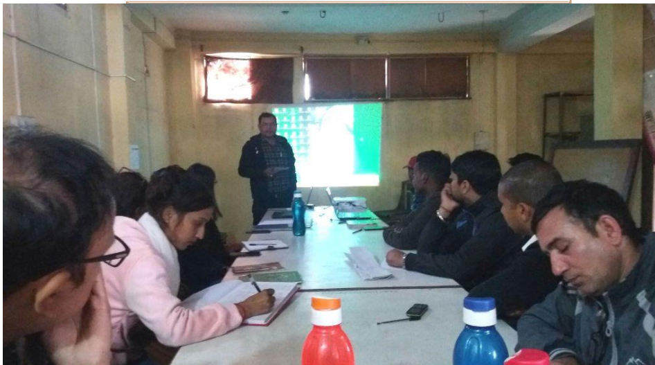
Joint staff meeting