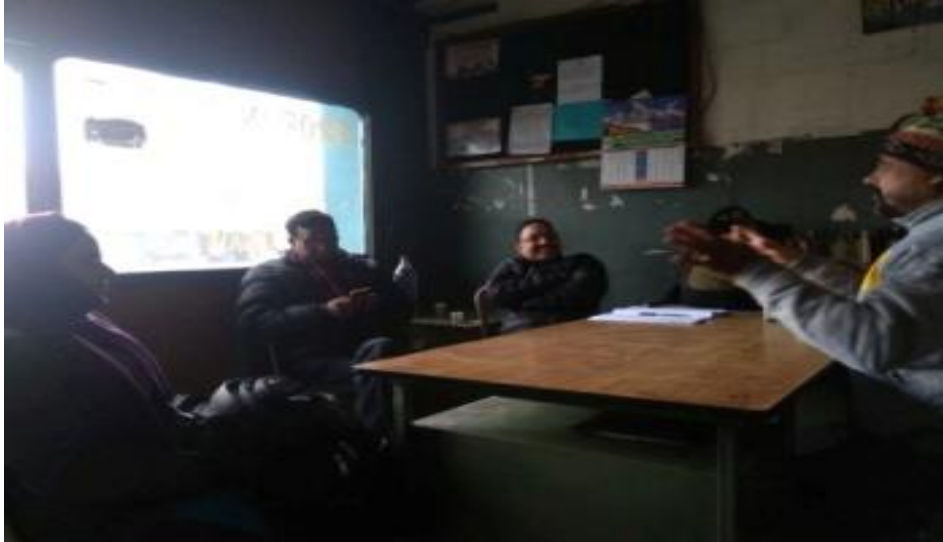
Joint Monitoring Visit